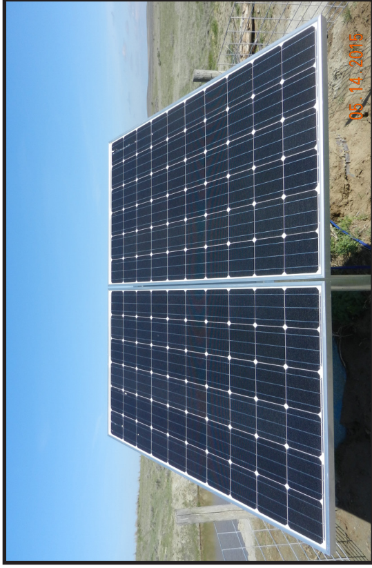
Solar (Weston County Conservation District)