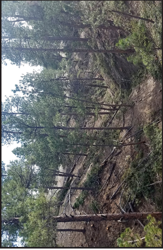
Timber (Weston County Conservation District)